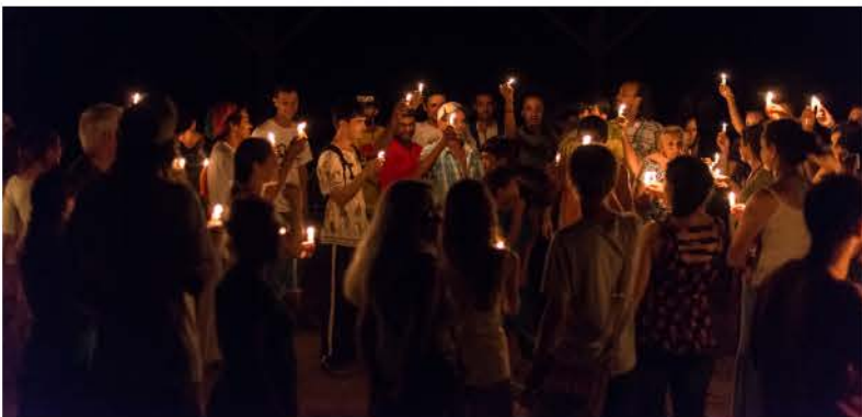
Opening event of the Youth Festival

Eleven spectacular days of experiences in the four dimensions of sustainability: social, economic, ecological, and cultural. Everyone who participated was able to exchange knowledge and experience about how to live well in the forest. In a collaborative game, the youth could show their potential to dream, plan, achieve and celebrate positive changes in the community. Learning moments and forest practices, spiritual works, workshops, social technologies, music, talent show, art and lots of fun were experienced during those days. The participants were divided into four teams. They had to choose the team’s name and slogan (battle cry), which were: Libra da Justiça (Balance of Justice) - “Sou luz!” (I am light!); Semente Boa (Good Seed) - “Quem planta, colhe!” (Who plants, reap!); Guardiões da Floresta (Forest Guardians) - “Herdeiros Unidos!” (Heirs United!); and Triunfo Maior (Greatest Triumph) - “Ouvir, seguir a instrução!” (Listen, follow the instruction!) The teams went through several challenging tasks, among them to figure out what was Padrinho Sebastião’s heritage and what he had predicted.