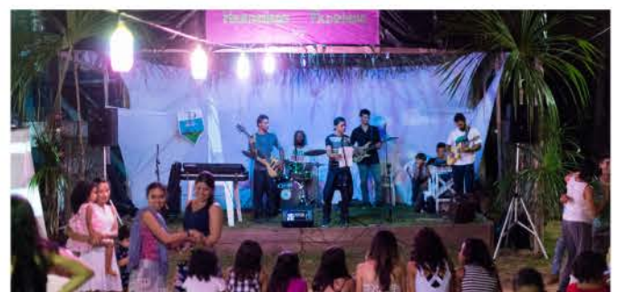
Musical show celebrating Mapiá’s 35th Anniversary

The dreamed celebration became reality: colored lights, many kinds of musical styles, dances and choreography, harmony and joy. All the community together: children, youth, adults and elders having fun during a spectacular party.