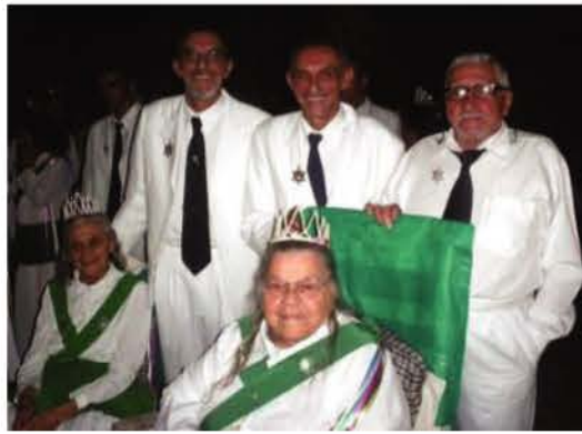
Padrinhos and Madrinhas

Among many of his stories, there is his famous saying: "In this village, where my sight reaches, my hoe has passed".