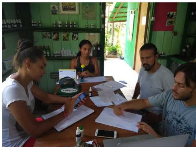
CMF team during meeting with ISES team / AmaGaia Program

LAST MARCH, WITH THE SUPPORT OF AMAGAIA PROGRAM, CENTRO MEDICINA DA FLORESTA (CMF) LAUNCHED THE CAMPAIGN "SUPPORT A FOREST APPRENTICE", THROUGH THE COLLECTIVE FUNDING SITE JUNOS.COM.