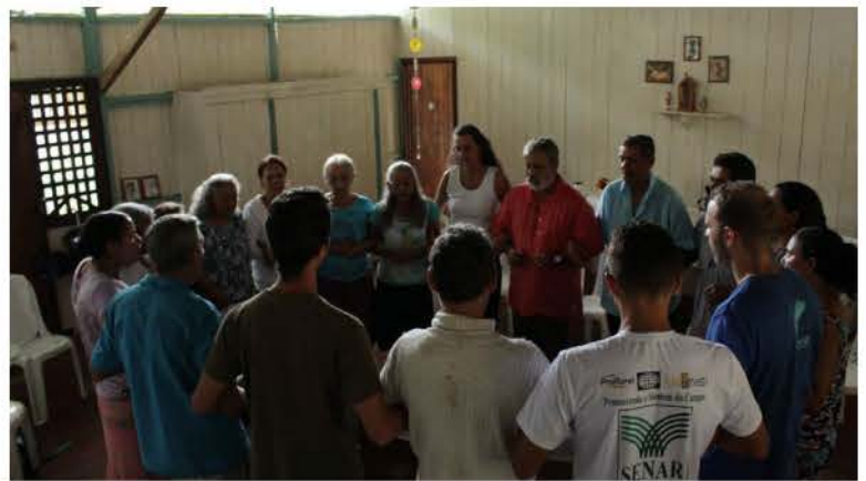
Workshop to prepare the community counselors