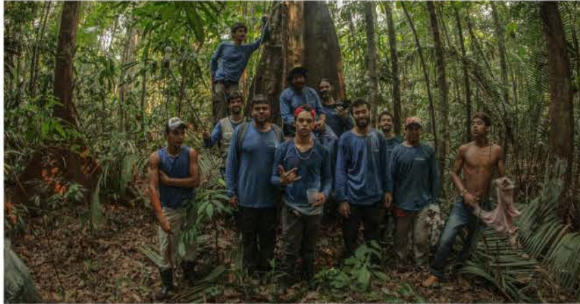
Team of the Sustainable Community Forest Management Plan of Céu do Mapiá