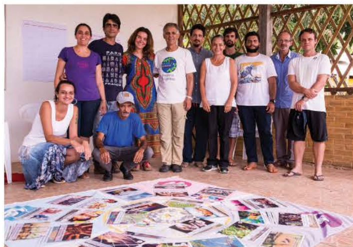
Community representatives and supporters during meeting with Kosha