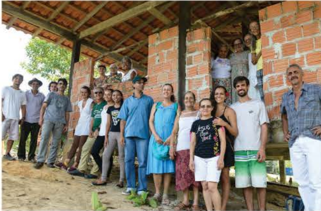
Centro de Medicina da Floresta – CMF's laboratory is already under construction, as a result of the CMF's partnership with the Banco do Brasil Foundation. It will be an important center for studies and researches of herbal medicines. Recently, CMF inaugurated its new Communitarian Kitchen with a great lunch for friends and collaborators.