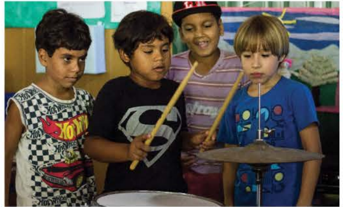
Children enjoying the drums