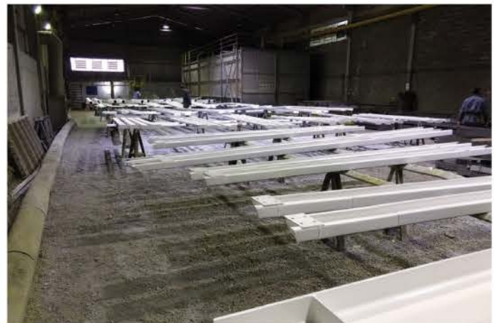
Metal structure to the New Temple

All material comes from São Paulo, Rio de Janeiro and Rio Grande do Sul (metal structure) and it is delivered at Boca do Acre, and transferred by ferries along the Purus River until the entrance of the Mapiá stream, and then transported to Vila Céu do Mapiá via the road.