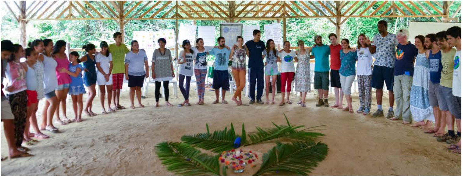
Youth Festival: Herdeiros do Padrinho