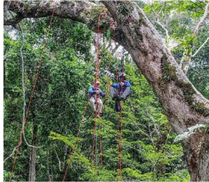
A team of forestry engineers from the Federal University of Viçosa, the Rio de Janeiro Botanical Garden and Adnet's Company of Forest Engineering came to Mapiá to renew the survey of timber species for the Forest Management Plan. The engineers also did aerial photographic work with the use of a drone, resulting in beautiful and useful images.