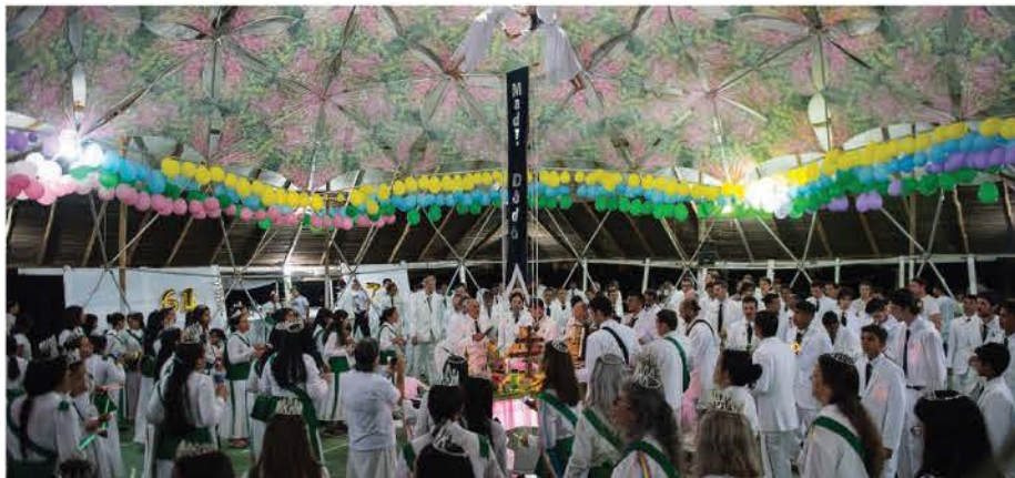
Spiritual work at the geodesic that had already been dismantled.

The Community Kitchen was equipped with a generator, refrigerator, freezer, three large tables and kitchen utensils. It serves the construction from Sunday to Sunday, providing: breakfast, lunch, afternoon coffee break (delivered at 4pm at the construction site) and dinner. At this point, it employs 25 people (22 women and 3 men). The workers are at Hospedaria Recanto da Seringueira.