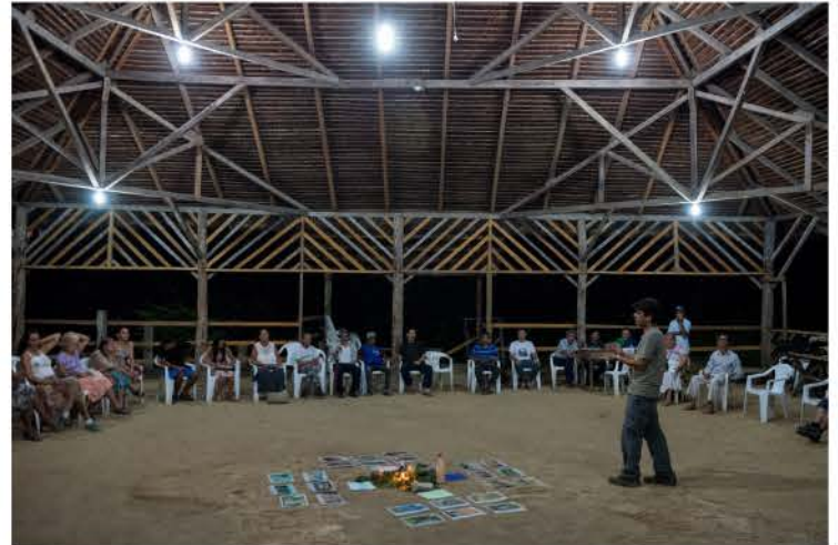
Retaking workshop of AmaGaia Program

The main result of this meeting was the alignment among participants about the actions needed to strengthen sustainability in the community, and the production of material to be used as a reference to guide actions and fundraising, utilizing the information collected. Following the workshop, the Working Groups responsible for priority actions met the support team in order to detail the implementation of the projects for this year.