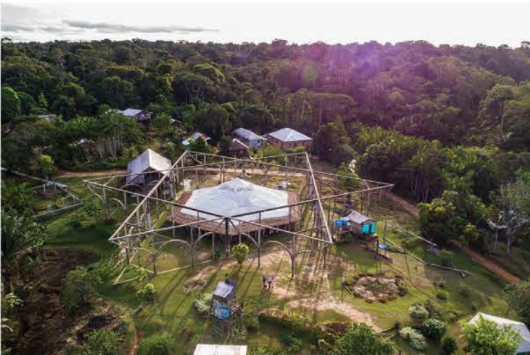
Aerial view from the construction site

THE BUILDING OF THE NEW TEMPLE HAS STARTED AGAIN. THE FOUNDATION AND COLUMNS HAD ALREADY BEEN COMPLETED. AN ADMINISTRATIVE AND LOGISTICAL OPERATION BEGAN TWO YEARS AGO, WITH THE ICEFLU BRANCH OFFICE IN SÃO PAULO HIRING A PROFESSIONAL TEAM AND A CONSTRUCTION COMPANY (SOBROSA) FROM SÃO PAULO.