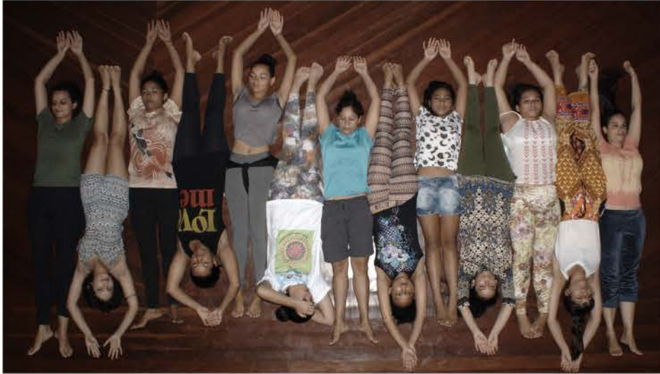
Youths during Bioenergy Therapeutic Living

PSYCHOTHERAPIST LEONARDO LIBÂNIO CHRISTO, FROM BELO HORIZONTE, HAS BEEN TO CÉU DO MAPIÁ THREE TIMES ALREADY, TO PERFORM A SERIES OF BIOENERGETIC THERAPEUTIC EXPERIENCES WITH THE COMMUNITY.