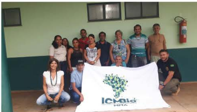
Participants of the GA's Beneficiary Profile