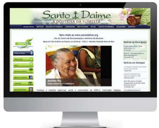
The official website of ICEFLU, santodaime.org , has been updated. In the website there is the history of the Doctrine, photos, recordings of hymns, and archives of hymns. Also published is updated information and the history of the Electronic Bulletin and Jornal do Céu, with everything that has already been published.