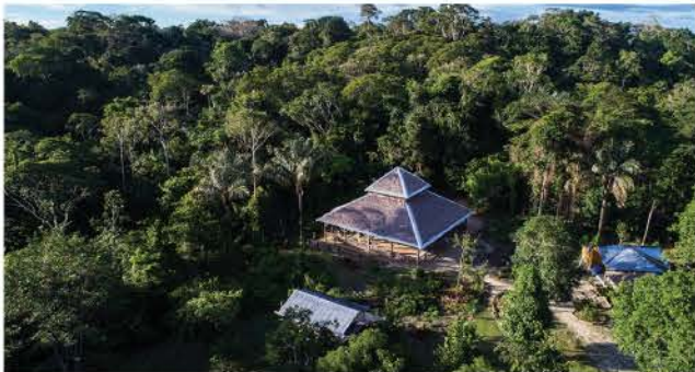
Santa Casa has rebuilt its straw roof, where spiritual works, events and meetings are held. All remodeled and with a removable wooden floor, it is ready to replace the church while it is being built. Access to the Santa Casa is also being improved, with the construction of a bridge over "Igarapé Repartição" and with the leveling of the road.