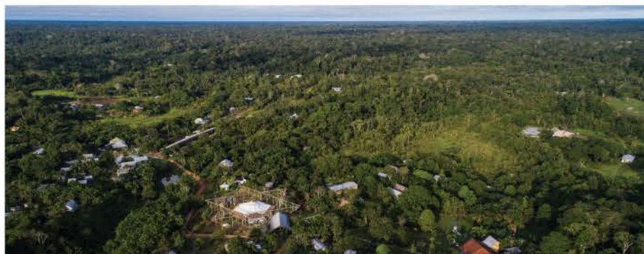
Aerial view from Vila Céu do Mapiá

In a moment of global challenges and transformation, numerous activities are engendering positive progress in Vila Céu do Mapiá, establishing it as the capital of a cultural transition movement for the new world, new people, and new system announced by Padrinho Sebastião .