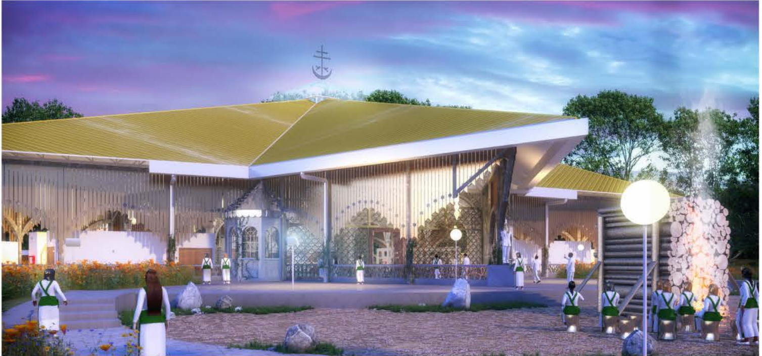
Digital model of the New Temple.

THE BUILDING OF THE NEW TEMPLE HAS STARTED AGAIN. THE FOUNDATION AND COLUMNS HAD ALREADY BEEN COMPLETED. AN ADMINISTRATIVE AND LOGISTICAL OPERATION BEGAN TWO YEARS AGO, WITH THE ICEFLU BRANCH OFFICE IN SÃO PAULO HIRING A PROFESSIONAL TEAM AND A CONSTRUCTION COMPANY (SOBROSA) FROM SÃO PAULO.