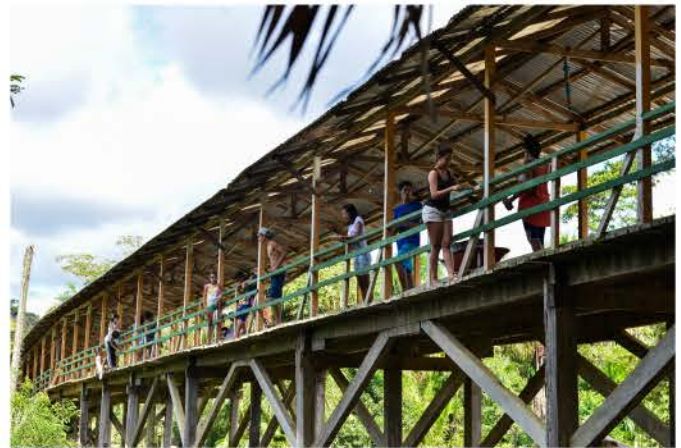
Bridge being renovated

For more information, visit: facebook.com/herdeirosdopadrinho