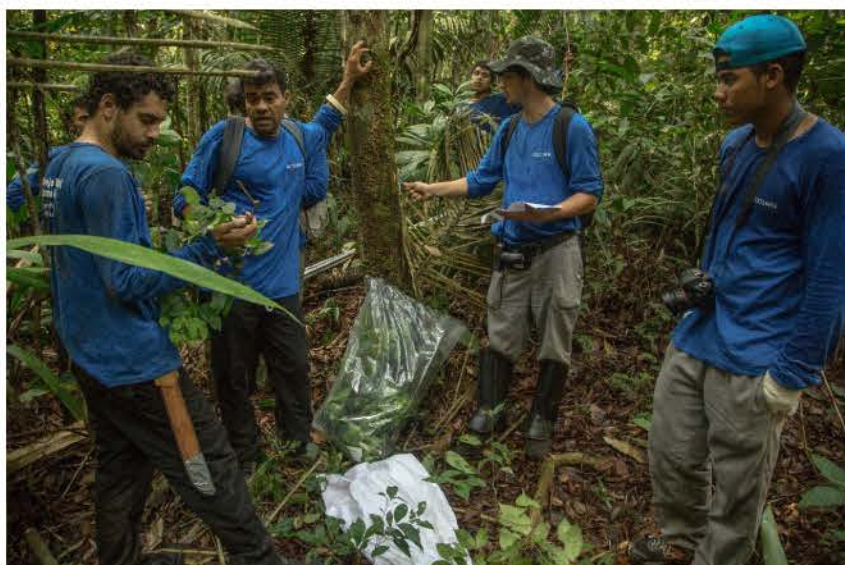
Team working in the area

In addition, Community Forest Management activities are being recorded on video and by photographs, including aerial drone shots, which will be extremely useful in the process of designing Mapiá's Master Plan. It is also planned to have a book published on the timber species mostly used by the community.